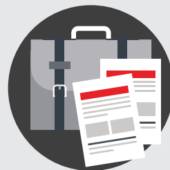
Portfolio Data, Losses & Premiums