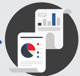
Risk Profiles & Growth Strategies

The company was able to see a number of commercially viable paths to achieve their objectives and run new scenarios in minutes .